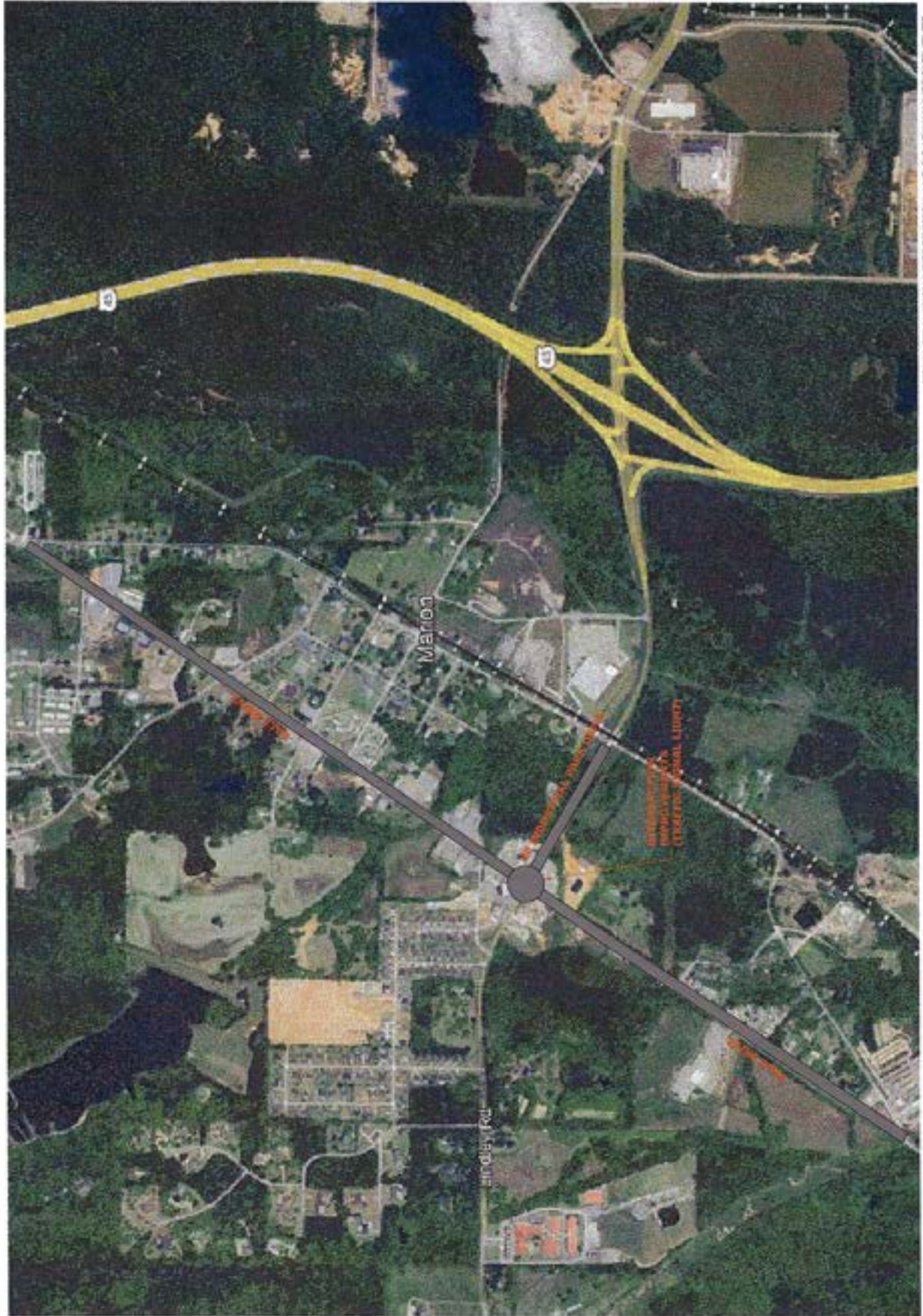
TOWN OF MARION INTERSECTION AND ROADWAY IMPROVEMENTS